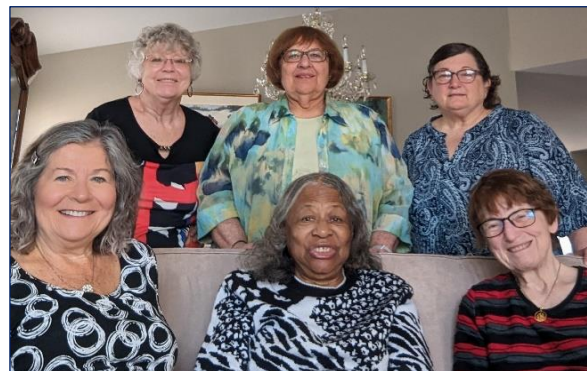
TH&VS Staff Mini Reunion in May 2022

My time in Timmins and at TH&VS was very special and I remember the kindness and generosity of Timmins folks - being able to cash an out-of-town cheque at Bucovetsky's solely on the basis that I was trustworthy because I was going to be teaching at TH&VS. Living in Timmins and teaching at TH greatly enriched my life and for this, I have always been grateful.