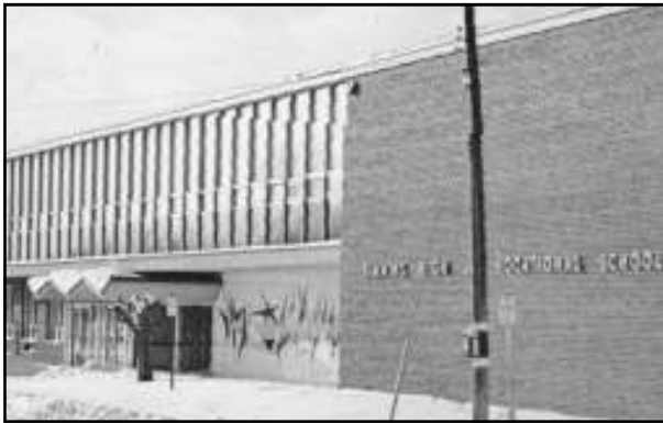
Timmins High on Preston Street South

The TH&VS Alumni Association is committed to enhancing excellence in education by pursuing private funding support for meaningful school wide needs and priorities in the hopes of maximizing the intellectual, academic, athletic, social & spiritual needs of each student.