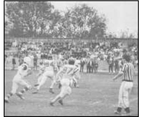
The Blues at the Hollinger Field in 1969

Over 30 former football players and alumni attended the booster organiza-